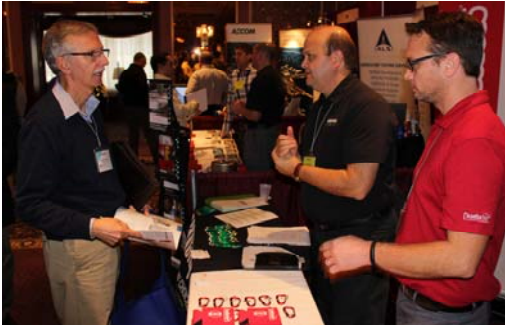
Exhibit Hours Wednesday, October 26th 7:45 AM - 6:30 PM Thursday, October 27th 8:00 AM - 2:00 PM